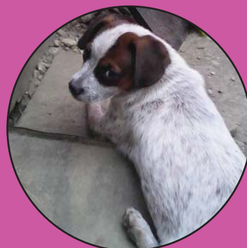
Amy, 4 months old mixed breed, female small sized