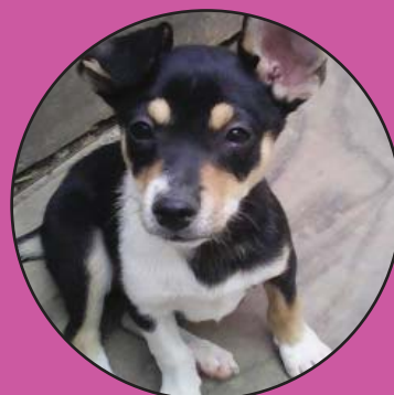
Papi, 4 months old chi mix, male pup, very small sized