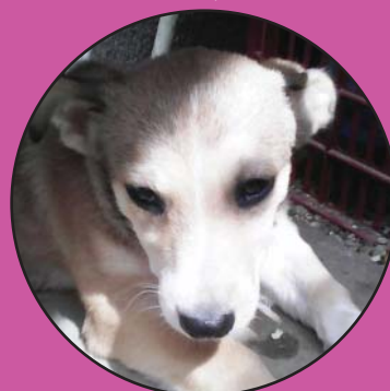
Maya, 4 months old mixed breed, female small sized